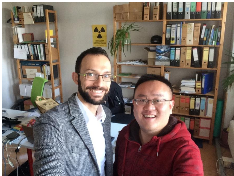
Working in EEB office