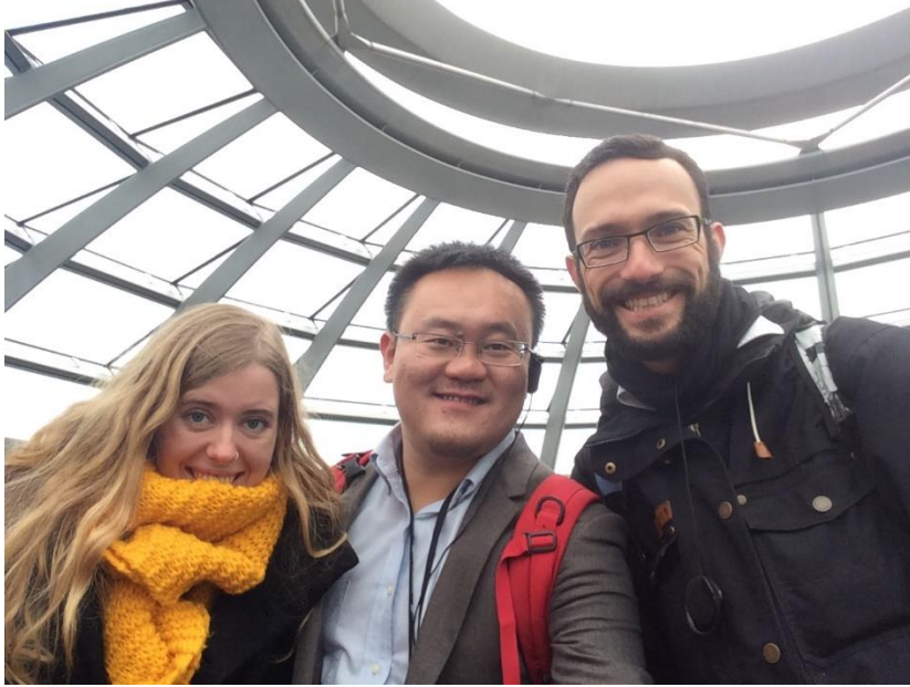
Visiting in German Parliament