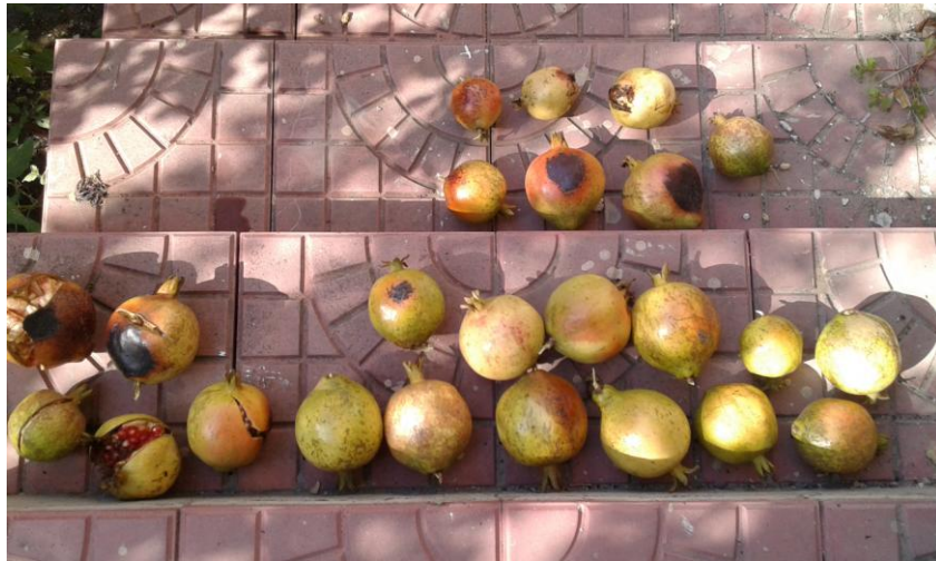
Pomegranate harvest from the garden

The little free time I took was spent playing capoeira, improving my Salsa dancing skills, a visit to the Great Wall, tailoring a suit, celebrating a birthday in a KTV (karaoke establishment), visiting the famous West Lake in Hangzhou, hanging out with exchange partners, improving my Chinese, learning to use Wechat, eating hotpot, mooncakes and other delicacies, celebrating the mid-autumn festival with Zhang Di's family and harvesting fruits in the garden.