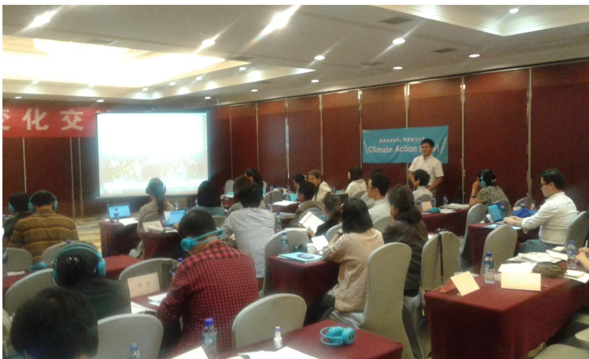
The East Asia Climate Network Conference in Tianjin

China Coal Cap Project, Greenovation Hub, Youthink Center, China Youth Climate Action Network (CYCAN), International Rivers, Greenpeace, Centre for Sustainable Consumption and Production, Asia Infrastructure Investment Bank, China Carbon Forum, 350.org, German Embassy, Central and Eastern Europe Bankwatch and a Plant-for-the-Planet Programme Coordinator from Lanzhou.