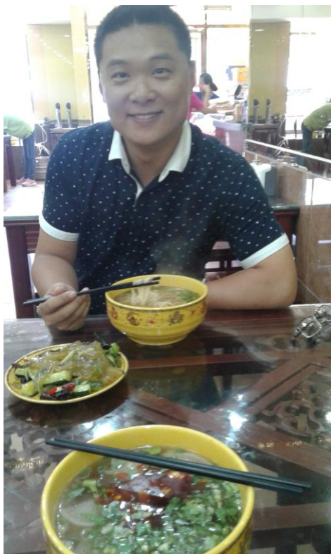
Lunch: Lanzhou Noodles (兰州牛肉面)

I was also invited to give a presentation on the UN climate negotiations at the CYCAN COP21 preparation workshop and held a webinar on zero emissions for a Latin American audience.