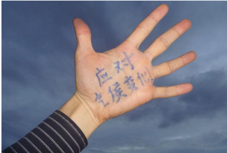
Photo used in our Weibo campaign for Climate Strike Day in China

From Sunday we started a Weibo Campaign for Climate Strike in China (where Climate Strike became known as Climate Action Day) which saw a readership of a couple of thousand people.