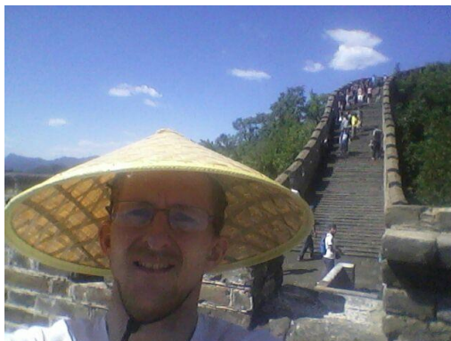
Visit to the Great Wall North of Beijing

A routine that proved very helpful was contacting and interacting with friends and colleagues in other countries via whatsapp while in the metro. Because the Envirofriends office which I also called my home during the two months is quite far in the North of Beijing (though conveniently located close to a metro station), each appointment in the city usually involved at least an hour spent on the metro each way. Whatsapp and the cell phone made it possible to use this time productively for organizing the Climate Strike.