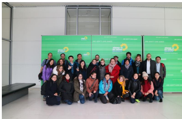
Field trip to my hometown