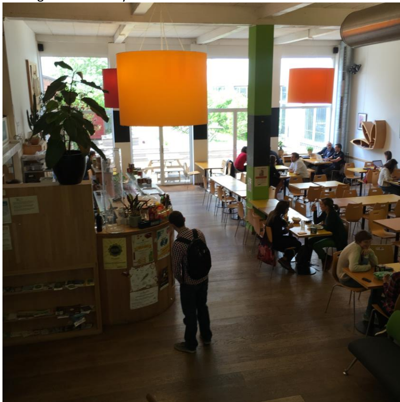
Learning European NGO's Operation