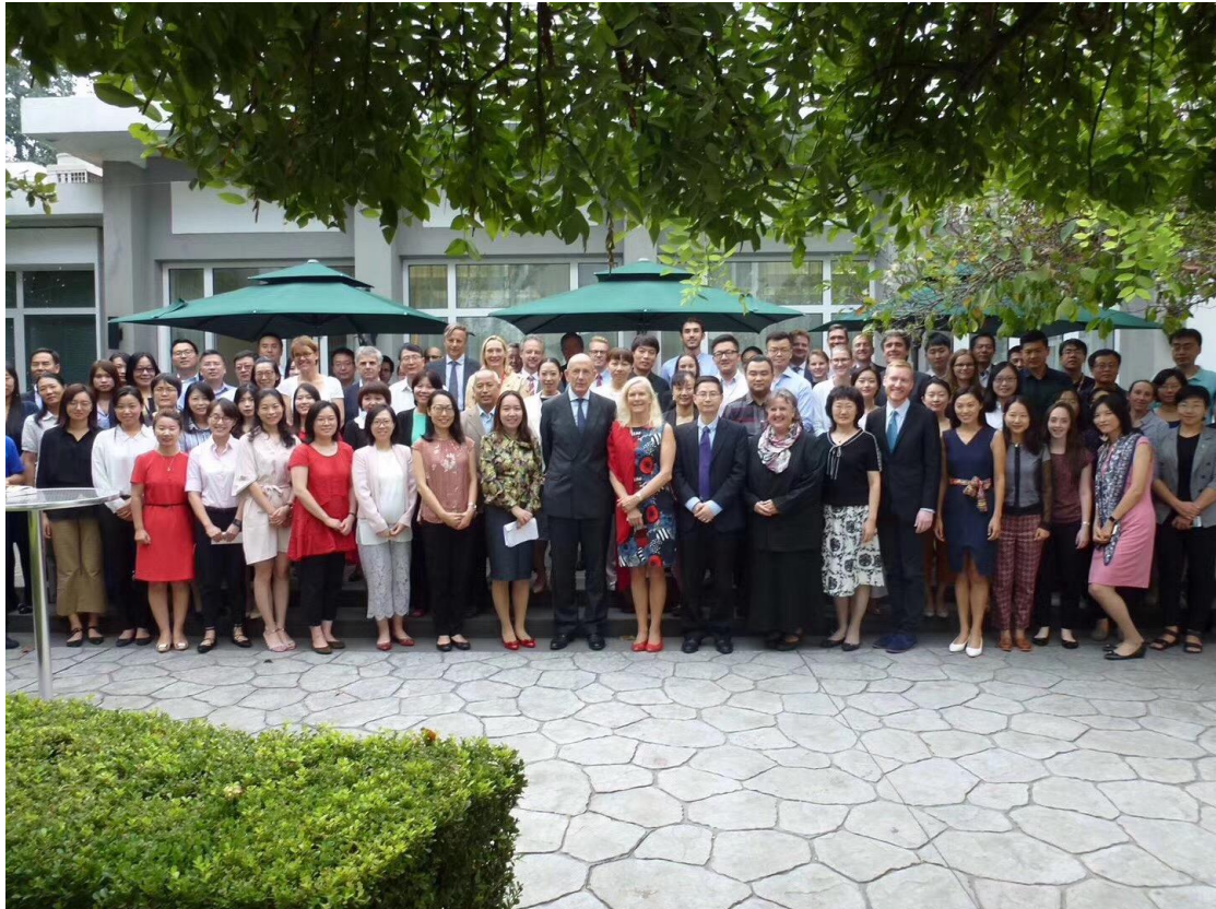
Attending: Green Finance and Credible Sustainable Standards conference