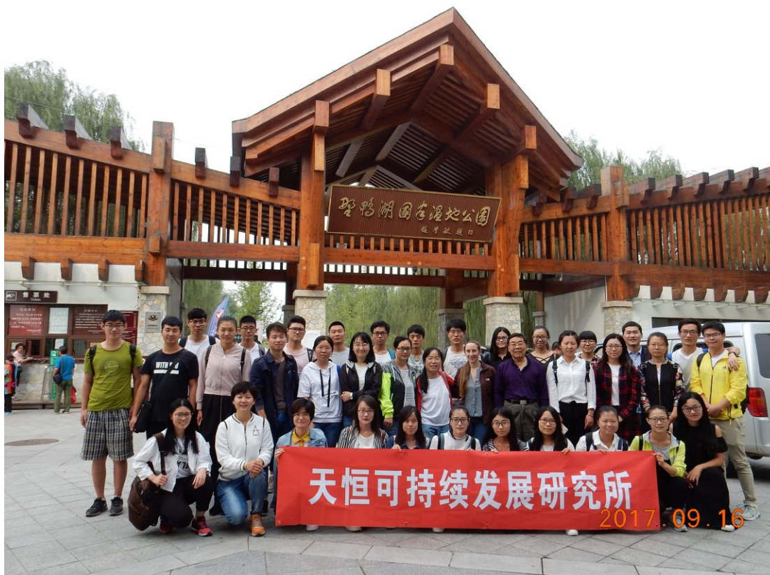
Visiting Wild Duck Wetland Park