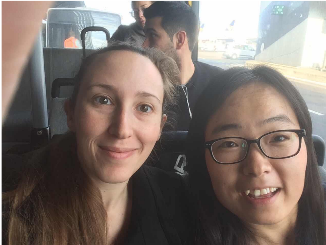
Taking Bus together for Meeting