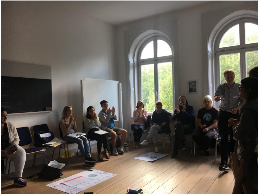
Having a Happy and Meaningful Workshop