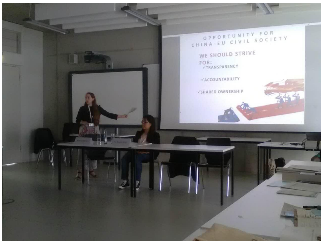
Presentation at the C20