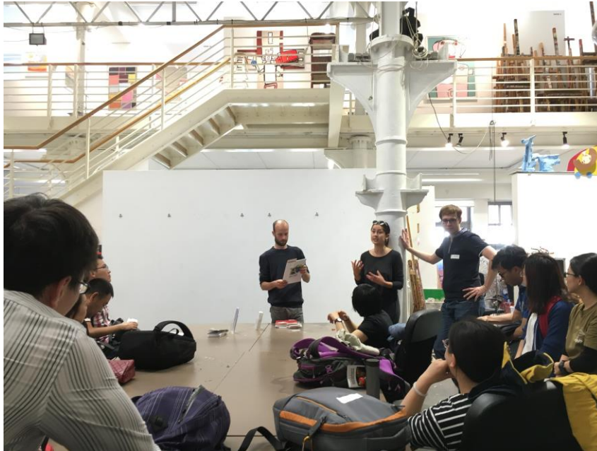
Visiting Public Gallery