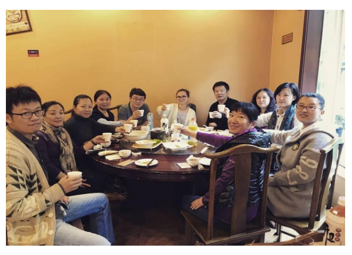
Participant Report EU-China Twinning Program 2017 This project is supported by